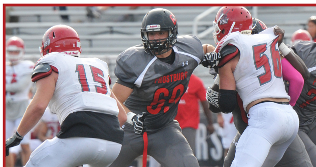
Behind an experienced offensive line, the Bobcats lead the NJAC in scoring offense and total offense